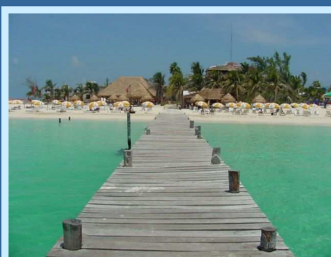
Lunch at Playasol

-Groups of 15 or more people can have Private Catamaran