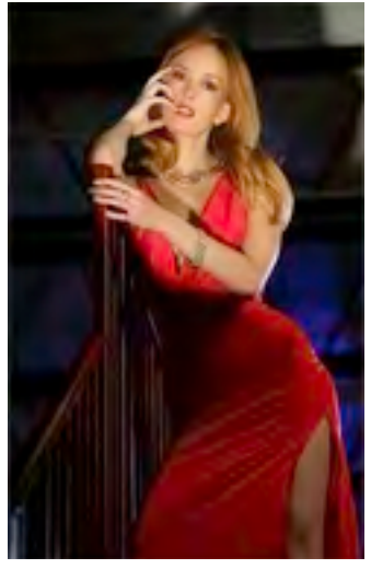
Get to the next level Portraits made easy with available light.

By just applying some basic photography composition techniques your photographs will leap from the ordinary to simply outstanding!