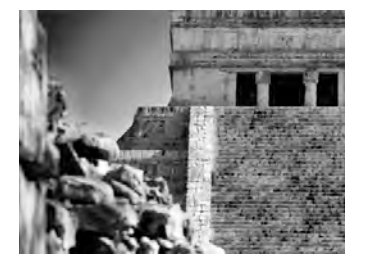
Learn about composition

When you know what the rules are, you can break them.